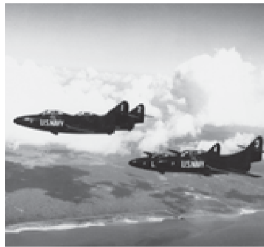
The Blue Angels, formed in 1946 and based in Pensacola, is the United States Navy's flight demonstration squadron.