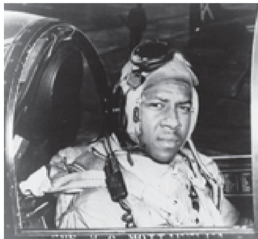
Ensign Jesse L. Brown, the U.S. Navy's first African American naval aviator, seated in the cockpit of an F4U-4 Corsair Fighter plane.