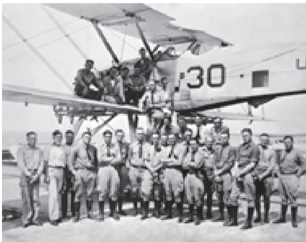
Pilots at Naval Air Station Pensacola (NASP), 1921. NASP was the first Naval Air Station commissioned by the U.S. Navy in 1914.