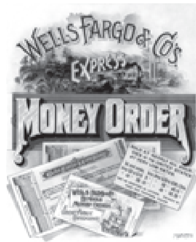
Poster advertising Wells Fargo express money orders, c. 1900s.