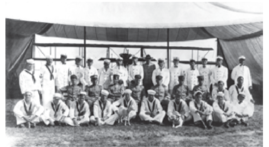
Naval Aviation Camp personnel during Naval aviation's first fleet deployment to Guantanamo Bay, 1913.