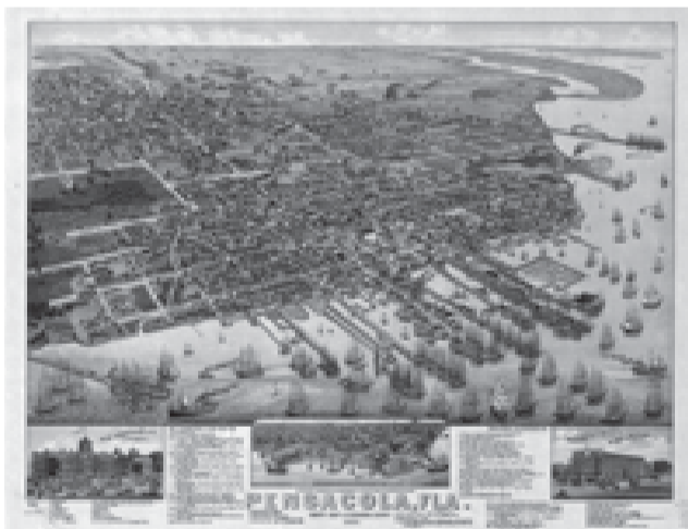
Illustrated map of Pensacola, the seat of Escambia County, 1885. The area was first settled by Spanish explorers in 1559, when Tristán de Luna y Arellano landed with over 1,400 people on 11 ships from Vera Cruz, Mexico.