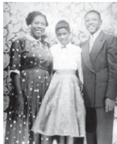
Pensacola residents dressed for a special occasion, c. 1932. (Cotton Family Collection)