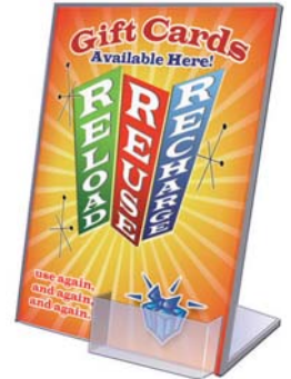
BSTI shown in MNRQ