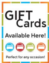
MNRH Gift Cards Window Decal