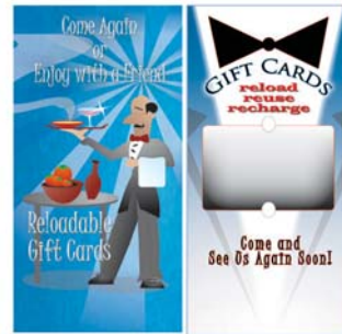
MNRR shown in MNRQ