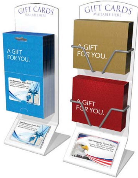
MNF2 Countertop Display (hardware included for both FC and JC carriers) Actual Size: 4 1/2" W x 12 3/4" H