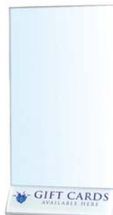
MNG5 Acrylic Table Tents (Displays 4" x 8" Poster)