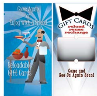
DNTT Dining Table Tent Poster Double Sided (4" x 8")