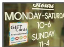
MNRH Shown in window