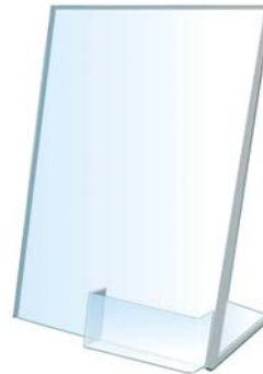
MNRQ Countertop Poster Display with Carrier Pocket (Displays 8 1/2" x 11")