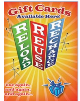
BSTI "Reload Reuse Recharge" Poster (8 1/2" x 11")