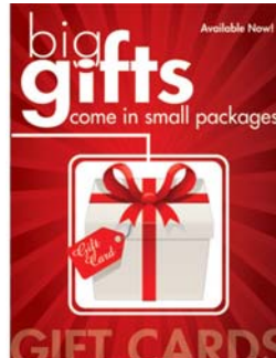
MNRR "Big Gifts" Countertop Poster Double Sided (8 1/2" x 11")