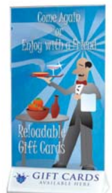
DNTT shown in MNG5